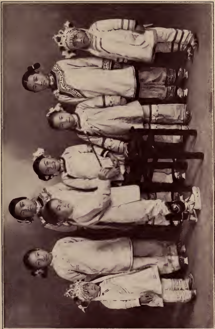
CHINESE CHILDREN'S CHOIR, ORIENTAL HOME, SAN FRANCISCO